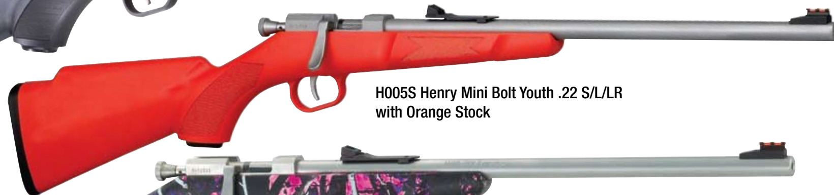
H005S Henry Mini Bolt Youth .22 S/L/LR with Orange Stock