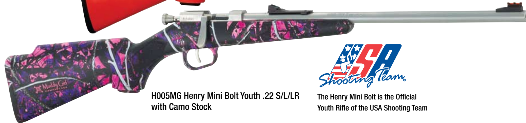
H005MG Henry Mini Bolt Youth .22 S/L/LR with Camo Stock