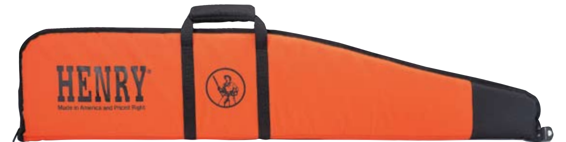
HCASEMB Henry Gun Case 34" fits H001Y and H005