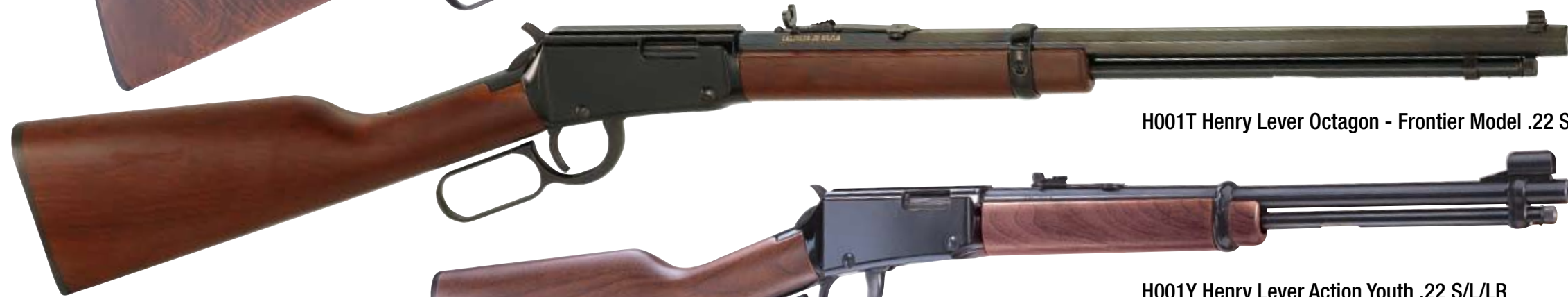
H001T Henry Lever Octagon - Frontier Model .22 S/L/LRLR