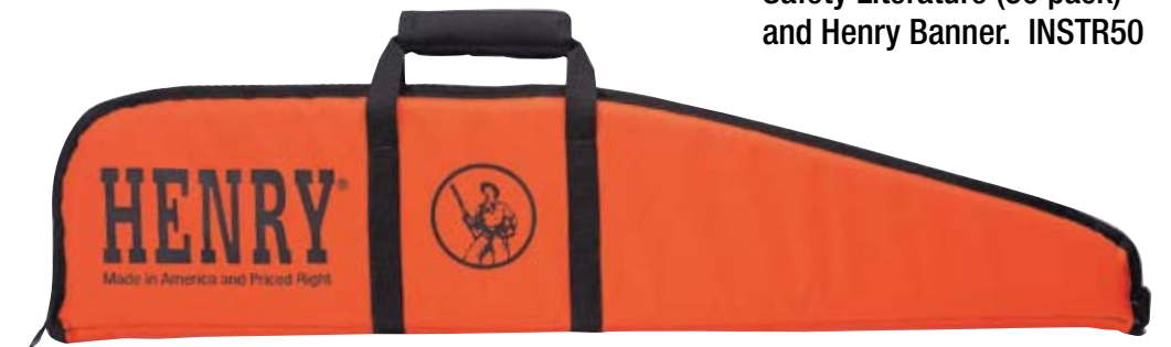
HCASE Henry Gun Case 40" fits H001/H007

I-Pack - Instructors Pack Includes (50 pack) Henry Catalogs, Firearms Safety Literature (50 pack) and Henry Banner. INSTR50