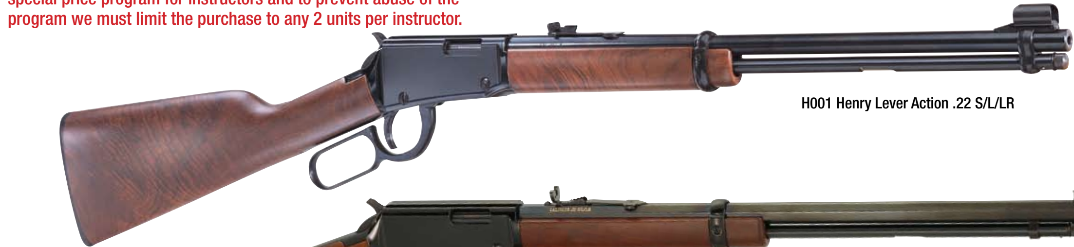
H001 Henry Lever Action .22 S/L/LR