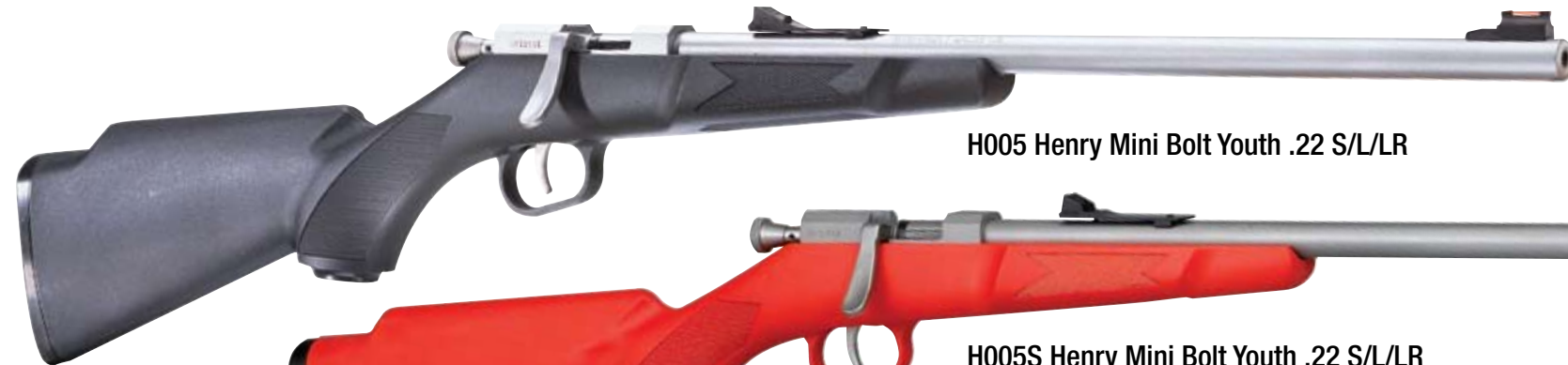
H005 Henry Mini Bolt Youth .22 S/L/LR