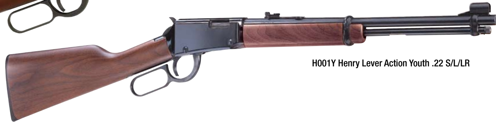
H001Y Henry Lever Action Youth .22 S/L/LR